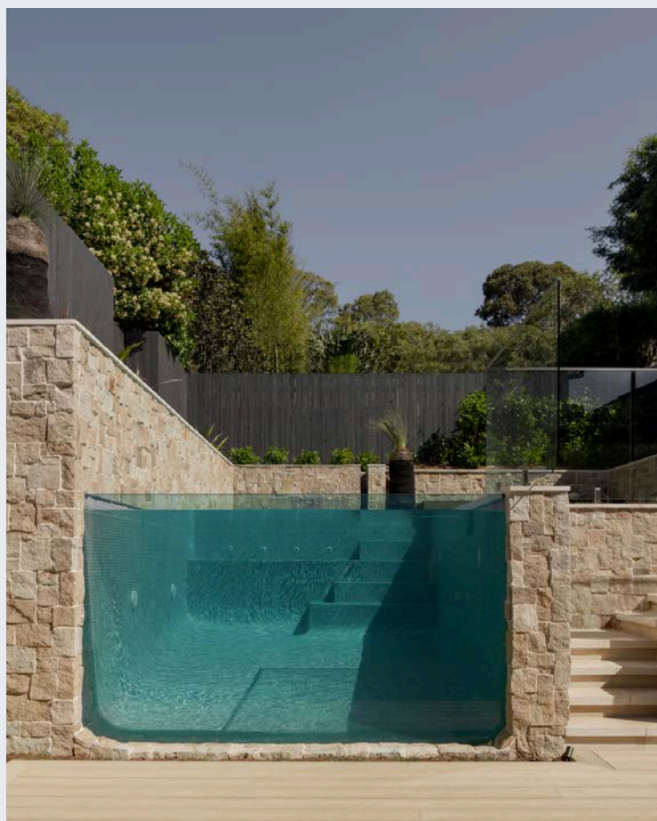
BUILDER: EQUILIBRIUM POOLS & LANDSCAPES

Judges reserve the right to reclassify entries, and a winner may not be declared in every category.