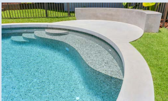
BUILDER: SENATOR POOLS PTY LTD ARCHITECT: CO-AP