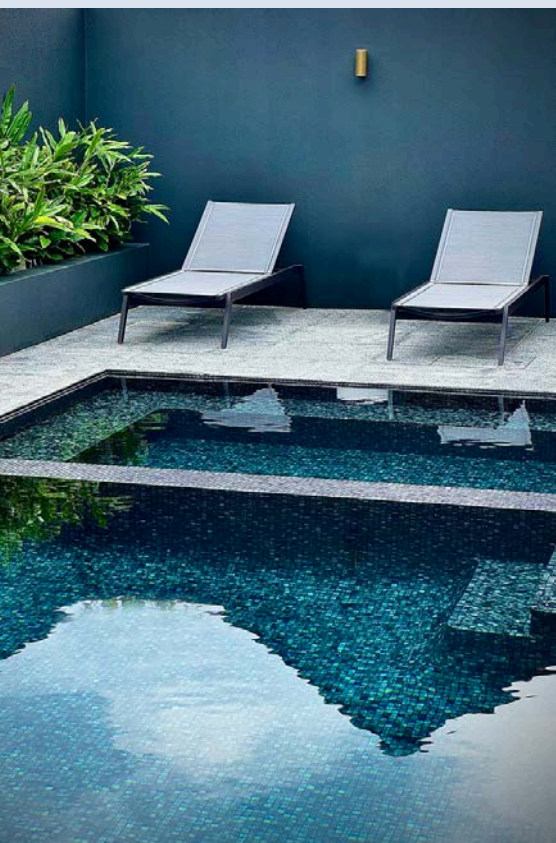
BUILDER: TECTONIC POOLS PTY LTD