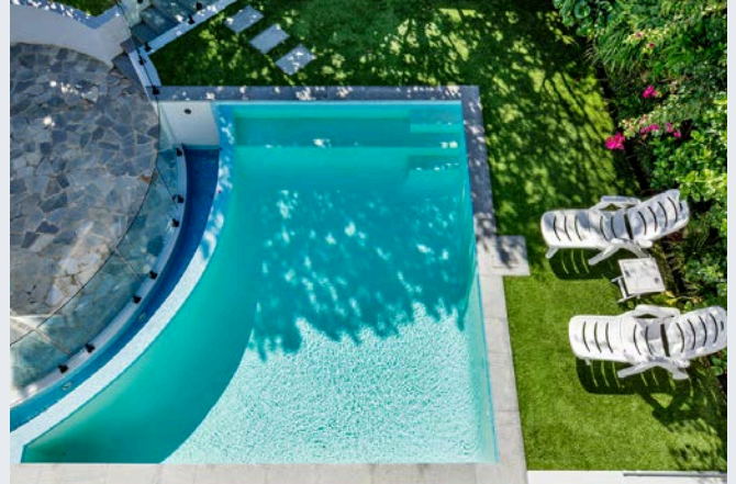
BUILDER: CRYSTAL POOLS PTY LTD

Entries in this category must encompass a pre-manufactured and pre-formed pool structure constructed using layers of fiberglass-reinforced composite materials. Pools must be designed and fabricated off-site, then transported and installed in a single unit.