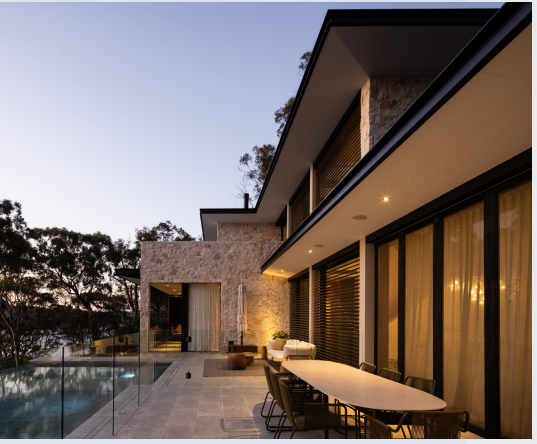
BUILDER: BAU GROUP ARCHITECT: CM STUDIO