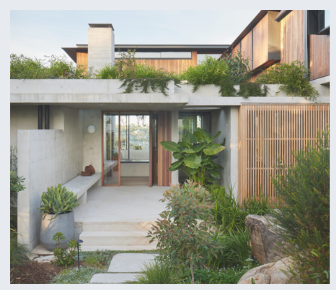
BUILDER: MAINCORP CONSTRUCTION GROUP ARCHITECT: DOWNIE NORTH ARCHITECTS

Projects located further than 30km from the Sydney CBD will incur an additional cost of $75 per hour.