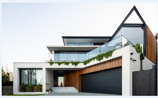
BUILDER: LAWSON AND LOVELL BUILDING SERVICES ARCHITECT: WATERSHED ARCHITECTS

- Nominations accepted only with accompanying entry