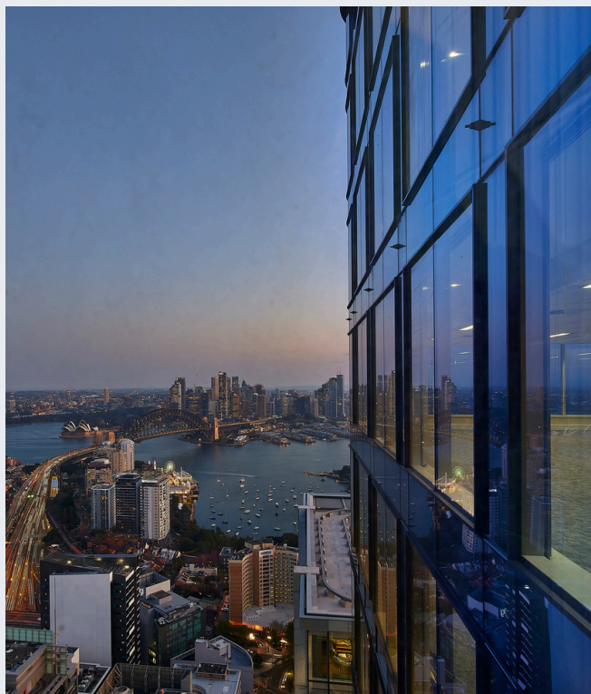
BUILDER: BILLBERGIA (NSW) PTY LTD ARCHITECT: FITZPATRICK+PARTNERS

An invoice covering all services rendered will be sent after your photoshoot has been completed.