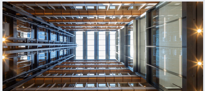
BUILDER: FDC CONSTRUCTION & FITOUT PTY LTD