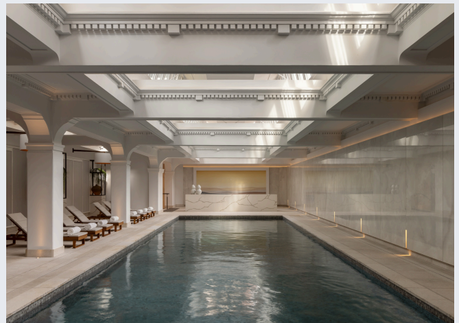
BUILDER: BUILT ARCHITECT: WEBBER AUSTRALIA