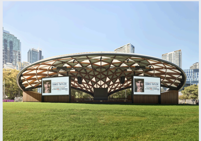
BUILDER: KANE CONSTRUCTIONS ARCHITECT: HASSELL

The judges reserve the right to reclassify any entry and a winner may not necessarily be declared in all categories.